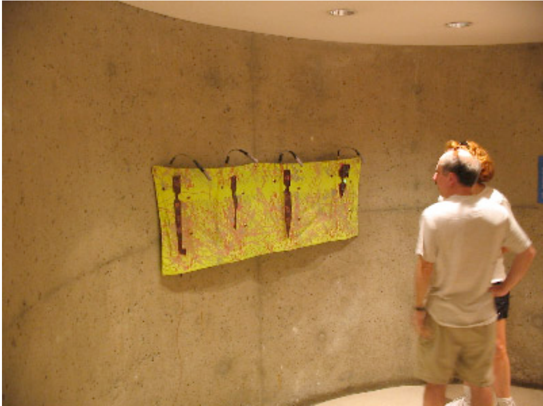
Quad Deerhorn Tapestry at AVAM, Baltimore